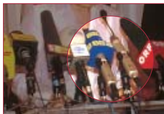
In demanding live sound or recording applications, the C 1000 S is as flexible and dependable as a Swiss army knife.

The red LED above the microphone switch stays illuminated when the remaining battery life falls below 45 minutes. When the mic is turned on, the LED blinks briefly to indicate that a usable battery is correctly inserted. The LED does not function when phantom power is used.