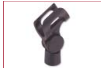
SA 63 stand adapter