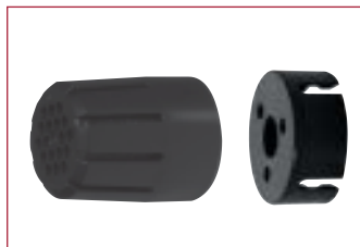
Polar Pattern Converter (left) and Presence Boost Adapter (right)