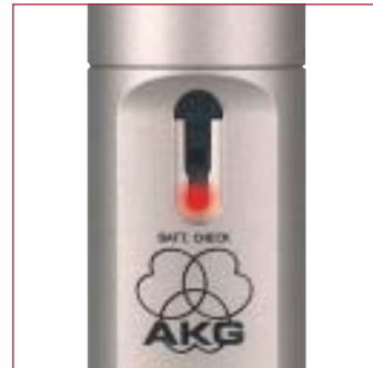
Battery status LED: Battery ok – LED blinks briefly