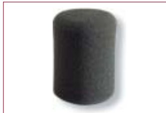
W 1000 windscreen

The red LED above the microphone switch stays illuminated when the remaining battery life falls below 45 minutes. When the mic is turned on, the LED blinks briefly to indicate that a usable battery is correctly inserted. The LED does not function when phantom power is used.