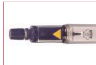
Choice of phantom power supply or internal 9 V battery

AKG Acoustics GmbH Lemböckgasse 21–25, P.O.B. 158, A-1230 Vienna/AUSTRIA Tel: (+43 1) 86 654-0*, Fax: -7516, e-mail: sales@akg.com